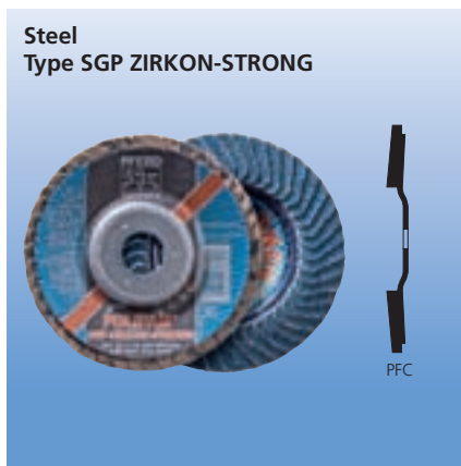
Steel Type SGP ZIRKON-STRONG